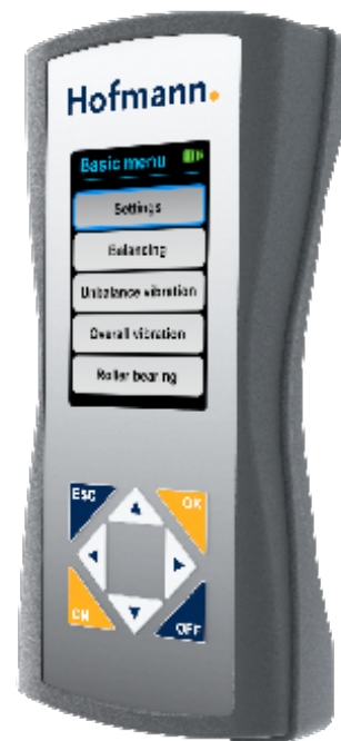
Minibalancer MI 2500